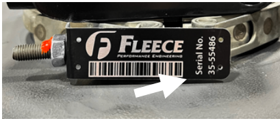
Example of Serial Number tag on NEW Cheetah turbocharger