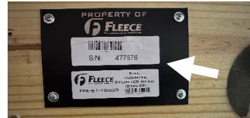
Example of Serial Number on Original Fleece Performance packaging