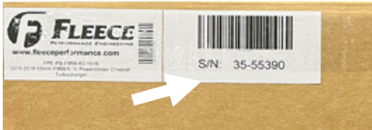
Example of Serial Number on Original Fleece Performance packaging